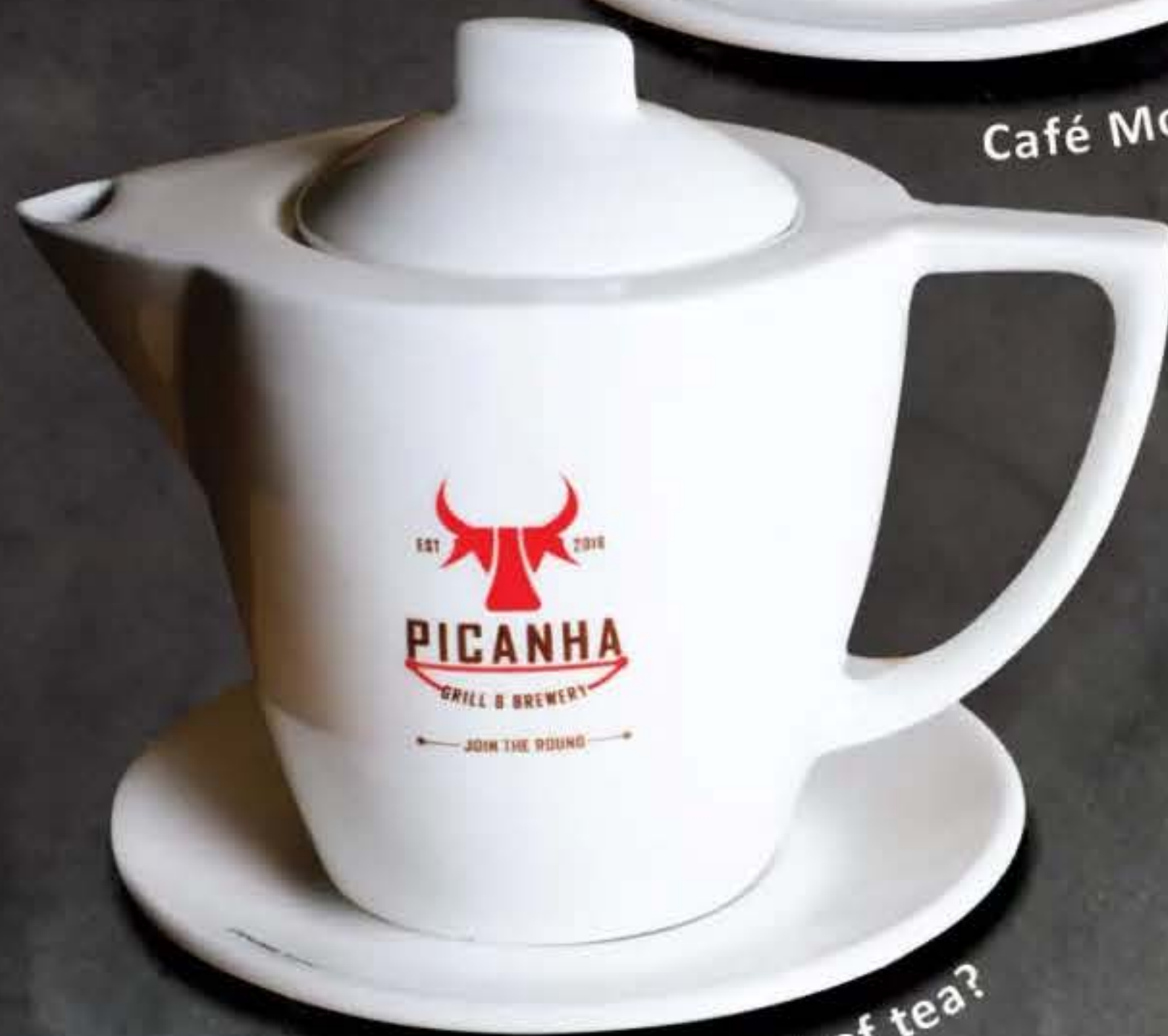
Pot of tea?