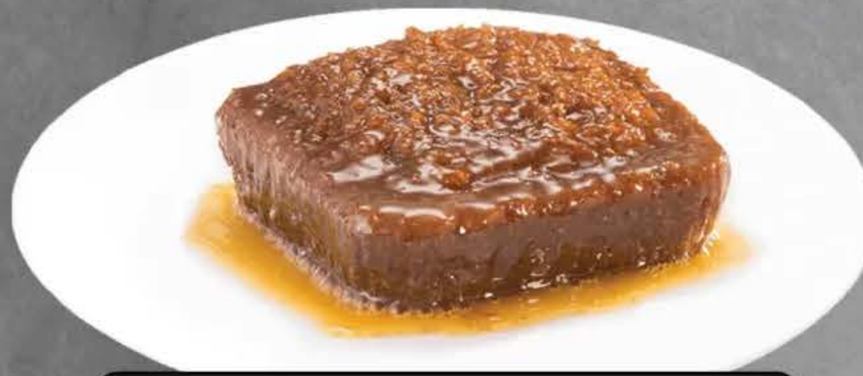
Homemade Malva pudding