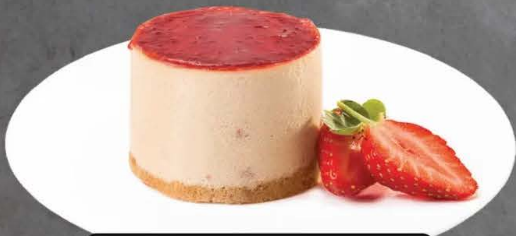
Strawberry cheese cake