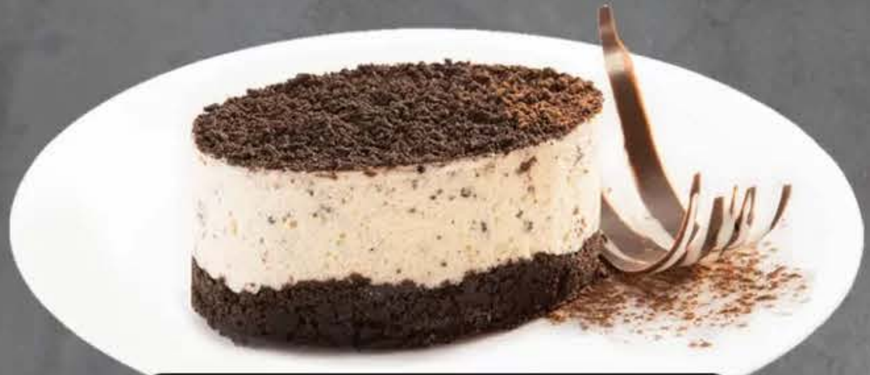
Cookies & Cream